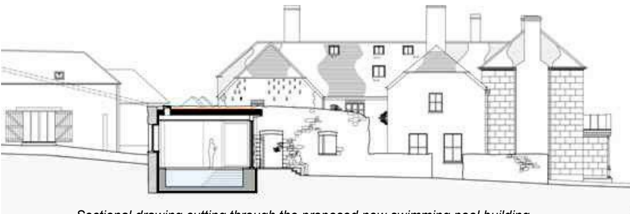
Sectional drawing cutting through the proposed new swimming pool building.

The new modern swimming pool building located within the ruined walls of the adjoining barn and stables will be capped with a green roof that will help it to blend into the surrounding landscape and have a stunning wall of glass to the view to the south. The thermal properties of this roof system will help to keep the building cool during the summer and well insulated throughout the winter.