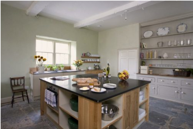
The finished interior of the farm house.